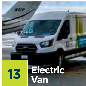
13 Electric Van