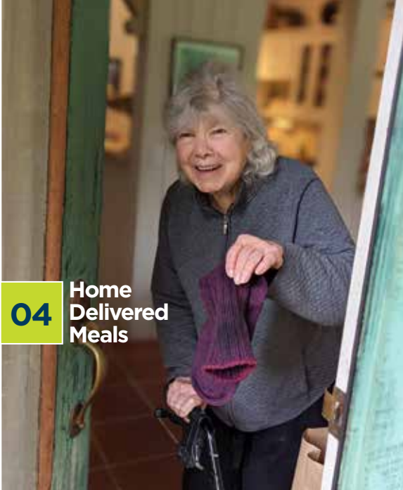
04 Home Delivered Meals