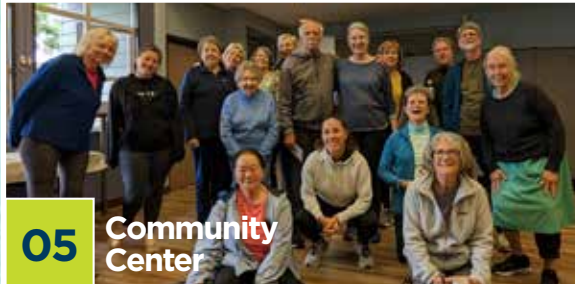
05 Community Center