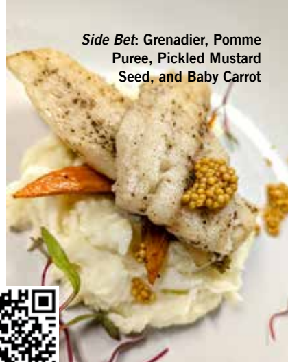
Side Bet: Grenadier, Pomme Puree, Pickled Mustard Seed, and Baby Carrot