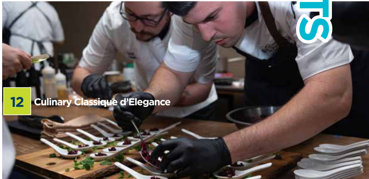
12 Culinary Classique d'Elegance