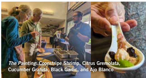
The Painting: Coonstripe Shrimp, Citrus Gremolata, Cucumber Granita, Black Garlic, and Ajo Blanco