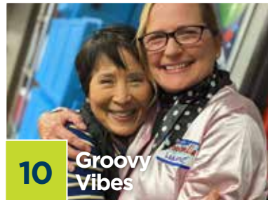
10 Groovy Vibes