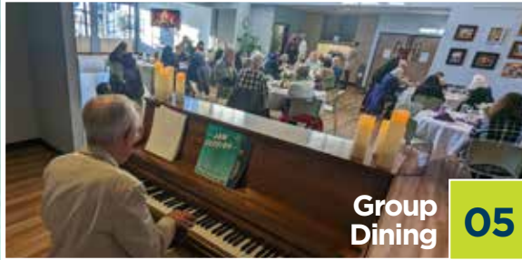
Group Dining 05