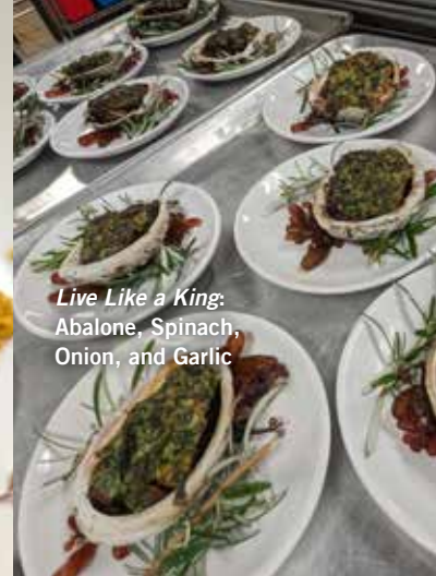
Live Like a King: Abalone, Spinach, Onion, and Garlic